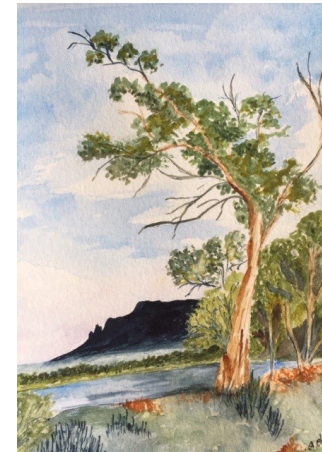
Maria Island