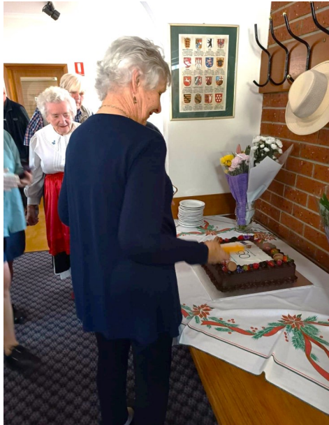
Our President cutting the cake