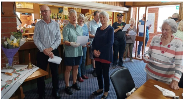
Singing the German National Anthem