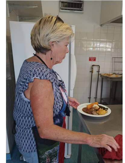
Easter Lunch delivered to your table