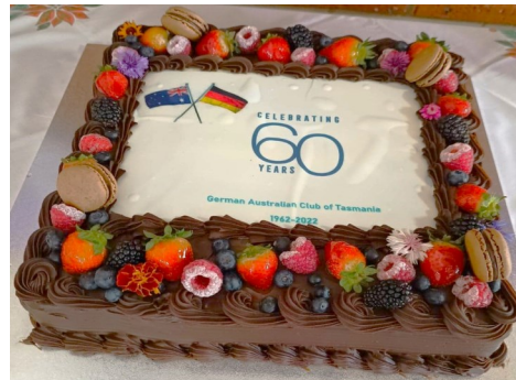
Beautiful and tasty chocolate ganache cake — HAPPY ANNIVERSARY