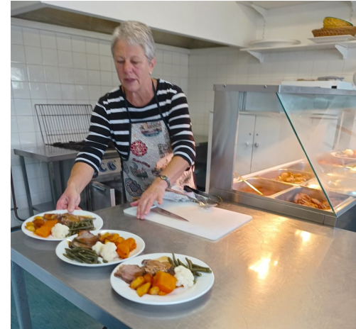
Easter Lunch Prep