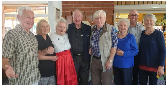
Celebrating the Club's 60th Anniversary