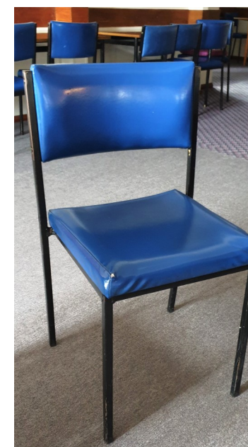
Old Chairs for Sale