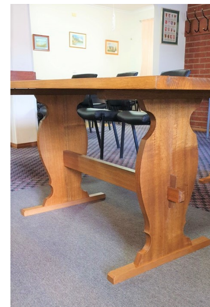
Brand New Bavarian Style Table