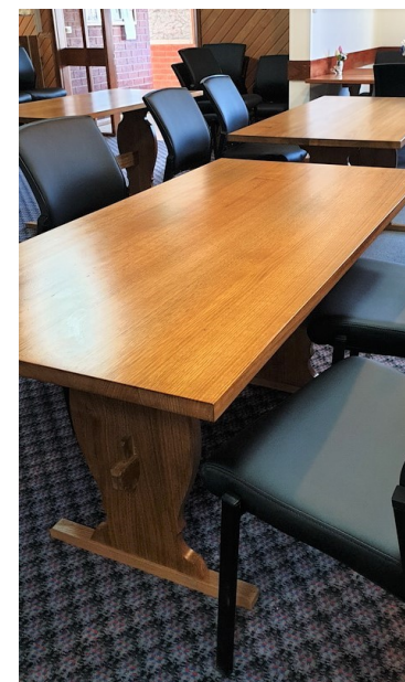
New Tables with New Chairs