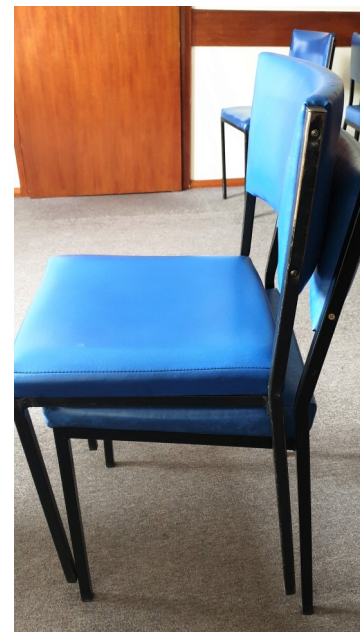
Old Chairs for Sale

Table measurements: 1500mm L x 745mm W x 710mm H