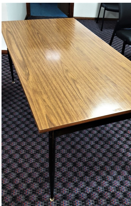
Old Table for Sale